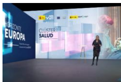
Horizon Europe: Clúster 1 - Health