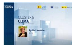
Horizon Europe: Cluster 5 - Climate, Energy and Mobility