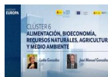
Horizon Europe: Cluster 6 - Food, Bioeconomy, Natural Resources and Environment