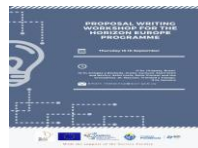
Writing Camps for Horizon Europe