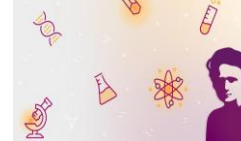
Marie Skłodowska-Curie Actions (MSCA) in Horizon Europe. Research mobility program