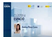
Horizon Europe: Cluster 4 - Digital, Industry and Space