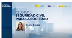
Horizon Europe: Cluster 3 - Civil Security for Society