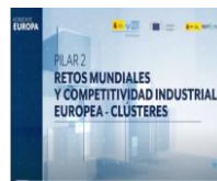
Horizon Europe: Cluster 2 - Culture, Creativity and Society